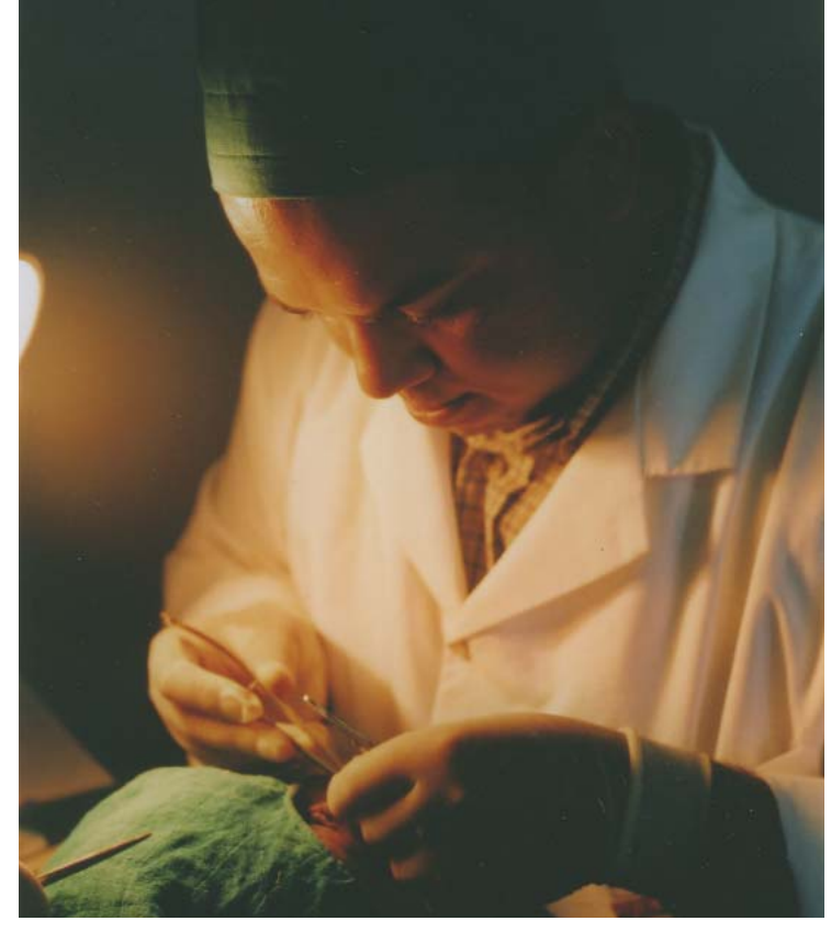
Surgeon operates on a Moroccan patient's eyelids, deformed by trachoma infection, to realign the eyelashes. Left untreated, the eyelashes rub painfully against the cornea, eventually scarring it and leaving the patient blind.

choma bacterium, comprises bacteria whose reproductive strategy and small size at one time led people to consider them viruses. One species, C. psittaci , causes psittacosis (so-called parrot fever), a respiratory infection transmitted from birds to people. Another, C. pneumoniae , causes a kind of pneumonia. And C. trachomatis , in addition to including strains that cause trachoma, has other strains that are responsible for sexually transmitted cases of urethritis and epididymitis in men and cervicitis, urethritis, and pelvic inflammatory disease in women (the last is a leading cause of infertility in the industrialized world).