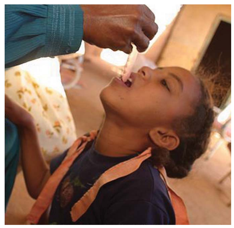
One oral dose of the antibiotic azithromycin will clear the eyes of a Sudanese girl of trachoma infection. An earlier kind of antibiotic treatment—a regimen of daily applications of eye ointment—was cumbersome and was not well tolerated by young children.

the extent and severity of disease where it is endemic. Such baseline studies can yield surprising results. For example, it had long been assumed that in arid, dusty environments, the irritation to people's eyes due to the dryness and dust would increase the risk of transmitting the bacterium. In Sudan, however, there proved to be high levels of infection both around Wadi Halfa, a desert settlement on the nation's northern border, and around Malakal, a town in the humid, lush south. One of the most disturbing findings in the Malakal area was that children as young as five years old were afflicted with trichiasis.