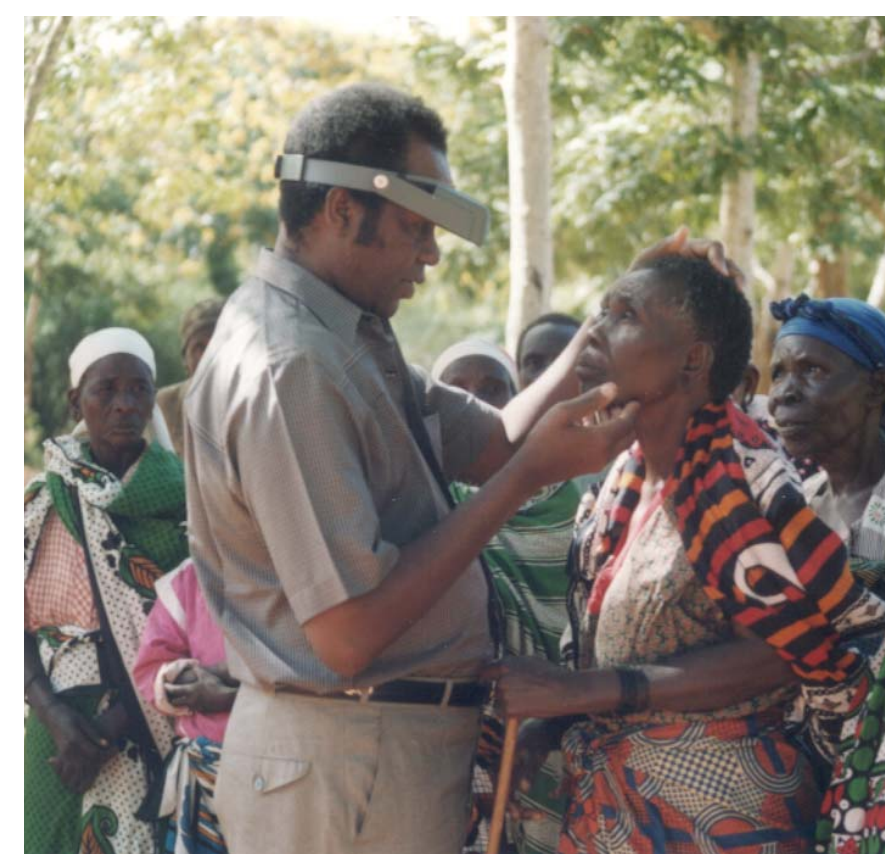
Health worker in Tanzania checks women for signs of trachoma. More women than men are victims of the disease, probably because they are in greater contact with infected children.

The Carter Center had already demonstrated its ability to manage a similar effort, coordinating a successful program to reduce the incidence of guinea worm disease, primarily in sub-Saharan Africa. As its name implies, that illness is caused by a parasite; it is transmitted solely through infected drinking water. For my colleagues and me at the