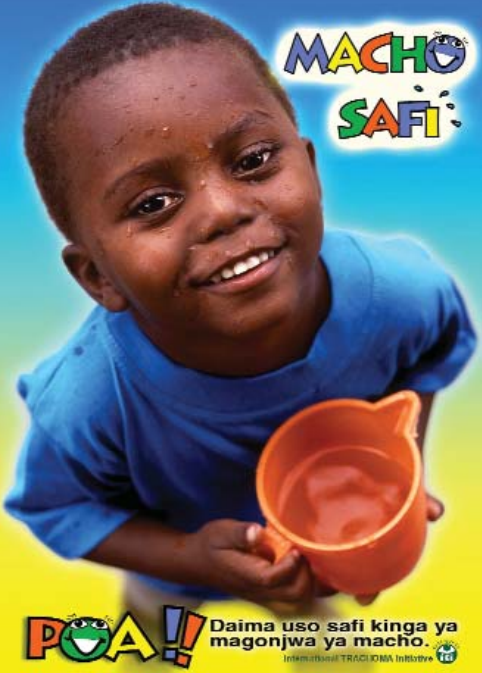
Posters designed for Tanzania by the International Trachoma Initiative help promote part of a strategy for combating trachoma known by the acronym SAFE (surgery, antibiotics, facial cleanliness, and environmental improvement). The Swahili text on both posters means "Clean Eyes—Cool!"

guiding blind adults instead of attending school. Blinded adults can do only limited kinds of work; they can contribute little to farming or childrearing.