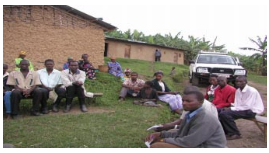
Some community members who attended participatory evaluation meetings

In the more recent times, however, there have been, on top of the question raised by Homeida, claims that substantial numbers of women, in Kisoro's communities of Bitare, Muko and Kikobero, do not take ivermectin