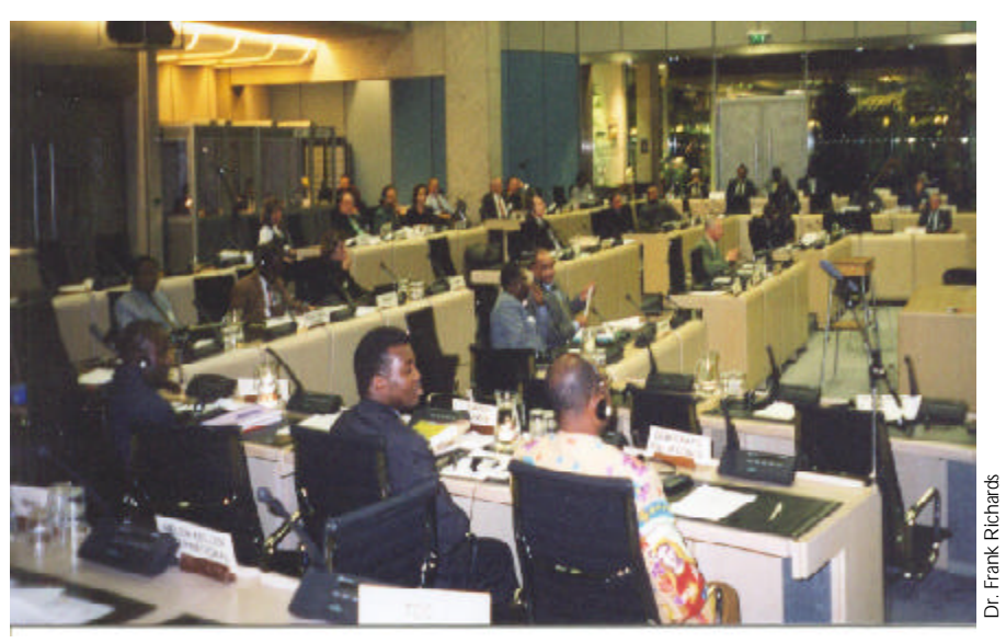
Representatives of the Joint Action Forum of the African Program for Onchocerciasis Control attend sessions in the Netherlands.

In addition, the forum expressed interest in knowing governments' contributions to APOC. Consequently, Nigeria announced that it was donating $50,000 to the APOC World Bank Trust Fund.★