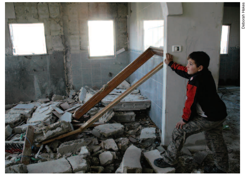
A Palestinian boy looks at the rubble of his home three days after it had been destroyed by Israeli rocket fire. He and his family now live in a refugee camp.

Although the 2006 election was recognized as an honest, fair, and free choice of Palestinian voters, inclusion of Hamas in the Palestinian National Authority has precipitated the withholding of international assistance and collected Palestinian funds from the people. This reduces humanitarian aid; precludes the payment of government salaries to police, teachers, nurses, and other social workers; and engenders both suffering and resentment in Palestine. The unmet demands are that Hamas recognize Israel's right to exist, forego violence, and endorse all previous agreements negotiated by the PLO. Hamas leaders respond that they will honor a