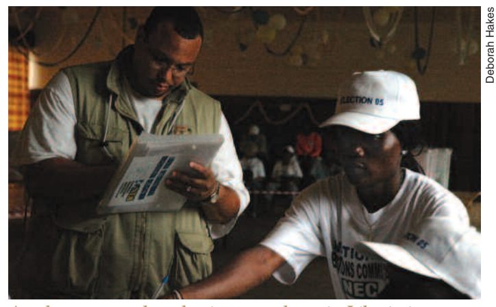
An observer watches election procedures in Liberia in 2005. Irish Aid provided grants for the Center's mission in Liberia and for the development of standards in election observation.

The assistance provided by Irish Aid is a reflection of Ireland's wider foreign policy interests in peace, justice, and human rights issues.