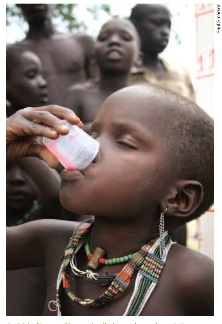
A girl in Eastern Equatoria, Sudan, takes a dose of the antibiotic azithromycin to protect herself from the bacteria that causes trachoma.

"Just imagine how useful it is for people to have a yearly dose of a systemic antibiotic, plus hygiene promotion, plus access to water and sanitation, and imagine what effect that also is having on diarrheal diseases, infection with worms, pneumonia, and other communicable diseases. We can have a powerful effect on health and development through the vehicle of trachoma control," said Dr. Emerson.