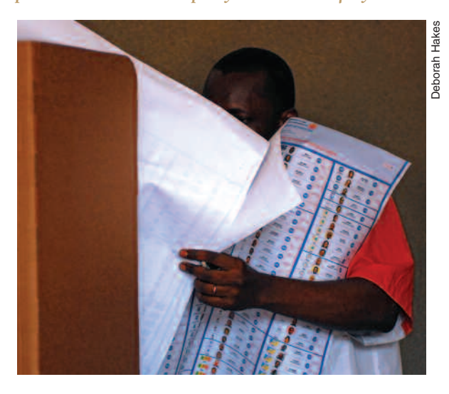
A voter struggles with a multipage ballot. More than 9,700 candidates were running for parliament.

of a long, costly, and conflictprone nation-building process."