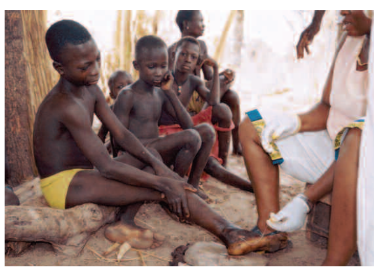
This girl in Togo with Guinea worm disease is featured in the public service announcement running on The Africa Channel.

The channel, which covers many aspects of African culture through news, music and entertainment, and documentaries generated by stations in Africa, will begin original programming in 2007.