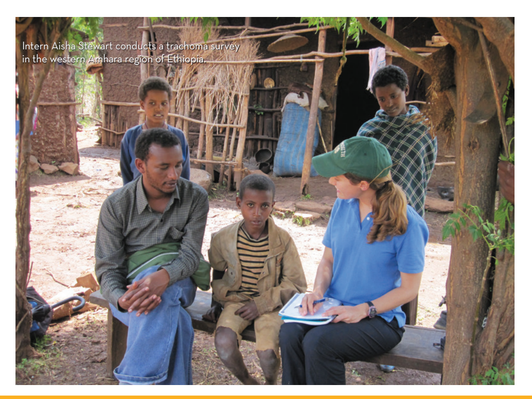
Waging Peace. Fighting Disease. Building Hope.