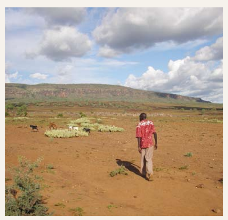
Next year's elections bring war-torn Sudan another step closer to an enduring peace.

The Carter Center is preparing to observe next year's elections, and staff have been in the country since 2008 as pre-election monitoring activities were launched. One of the key supporters of the Center's work in Southern Sudan and three border areas is USAID, the independent agency that provides international aid from the U.S. government.