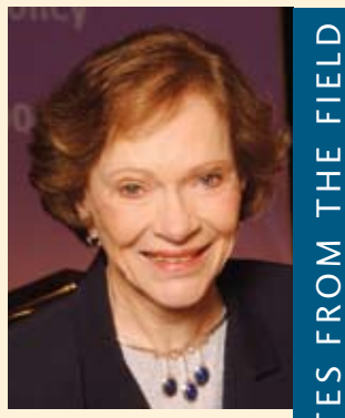
Former First Lady Rosalynn Carter is co-founder of The Carter Center.

WAGING PEACE. FIGHTING DISEASE. BUILDING HOPE.