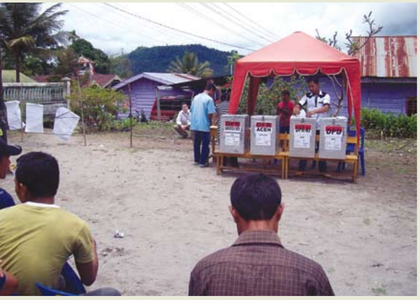
Citizens vote in the April 2009 legislative elections in Bener Meriah district in Aceh, Indonesia.

On April 9, 2009, the citizens of Aceh voted for the first time in national legislative elections since the peace agreement was forged in August 2005. In addition, the April elections marked historic changes in Indonesian elections, including the direct election of candidates from party lists and the role and power of the national election commission.