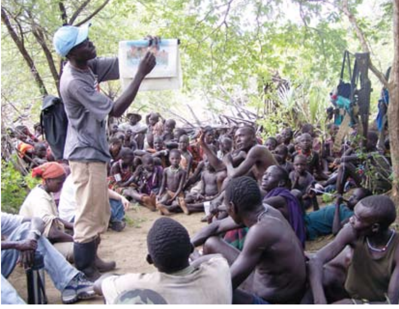
With the aid of an illustrated flip chart, a health worker explains to community members how Guinea worm disease is contracted.