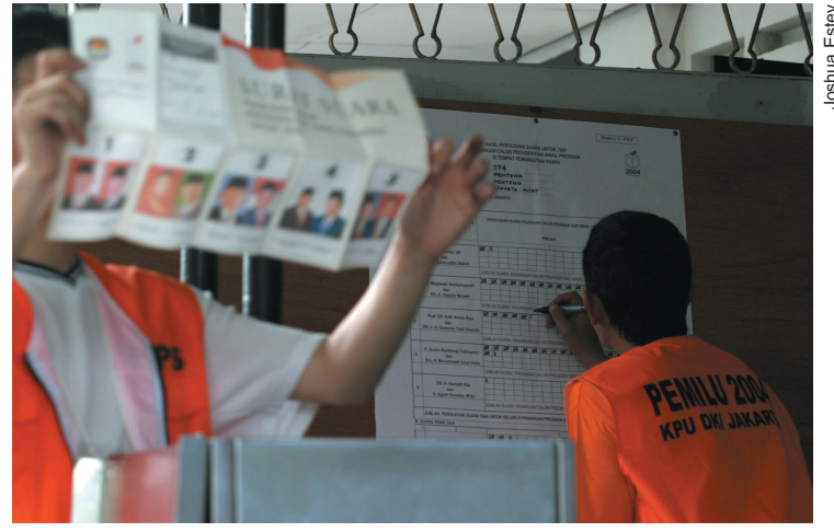
An election official examines a presidential ballot so the voter's choice can be officially recorded.

commitment to democratic principles and to holding leaders accountable."