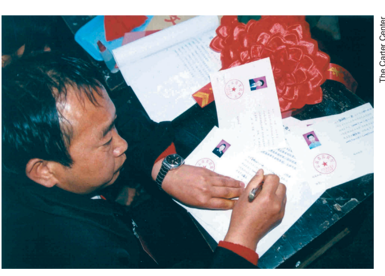
The winning village committee members were issued official certificates at an election spot in Yunnan province, China.

the opening speech at an international symposium on advancing political reform sponsored by the Center and the People's University of China. The conference examined the political, legal, cultural, and economic context of furthering political reform in China.