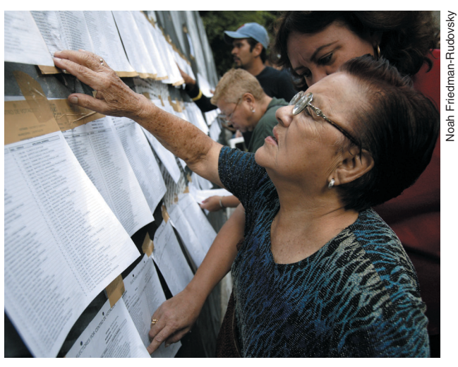
A woman checks her name on the voters' registry at a polling site in Caracas.

Away from the politics in the capital city, in small communities across