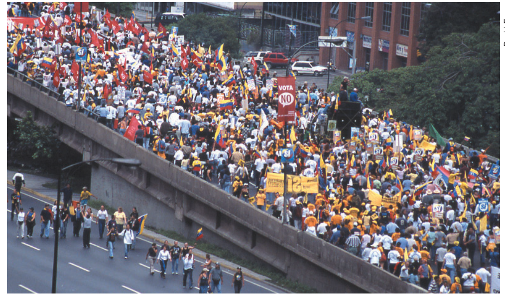
An Aug. 12 opposition march representing the "Si" vote passes by the Sabana Grande neighborhood of Caracas on the Francisco Fajardo highway.

recall vote of a president—culminated a process begun in November 2003 when Chavez's opponents began collecting a new set of signatures to petition for the recall vote. In all, the Center and the OAS observed, over a period of 10 months, the signature collections, the National Electoral Council's signature validation process, the reparos or signature corrections, and the referendum.