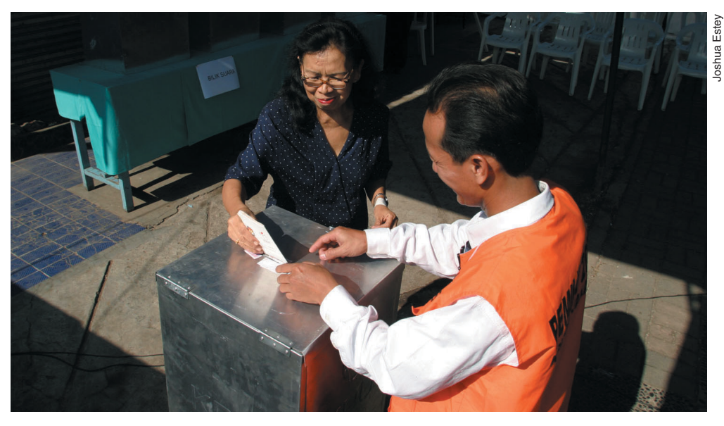
An official shows a woman at a Jakarta polling station where to drop her presidential ballot.

A problem in the first round, when ballots were declared invalid due to double punching because they were folded in such a way that some voters punched them without fully opening them, was corrected