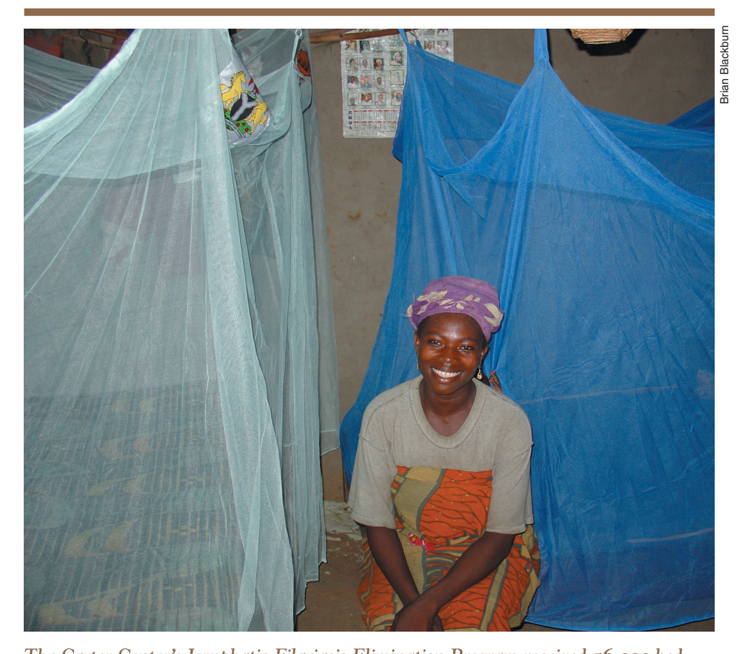
The Carter Center's Lymphatic Filariasis Elimination Program received 56,000 bed nets from Nigeria's ministry of health last spring in a combined effort to prevent the spread of lymphatic filariasis, being addressed by the Center, and malaria, a project of the health ministry. The nets are treated with the insecticide deltamethrin, which is safe to human beings yet kills or repels the mosquitoes that are the carriers of both diseases in rural Africa. The bed nets will be available in two local government areas of Plateau and Nasarawa states in Nigeria that are endemic for both diseases. This woman lives in Seri village in Plateau state.

together, we can stop Guinea worm now. The end is in sight.