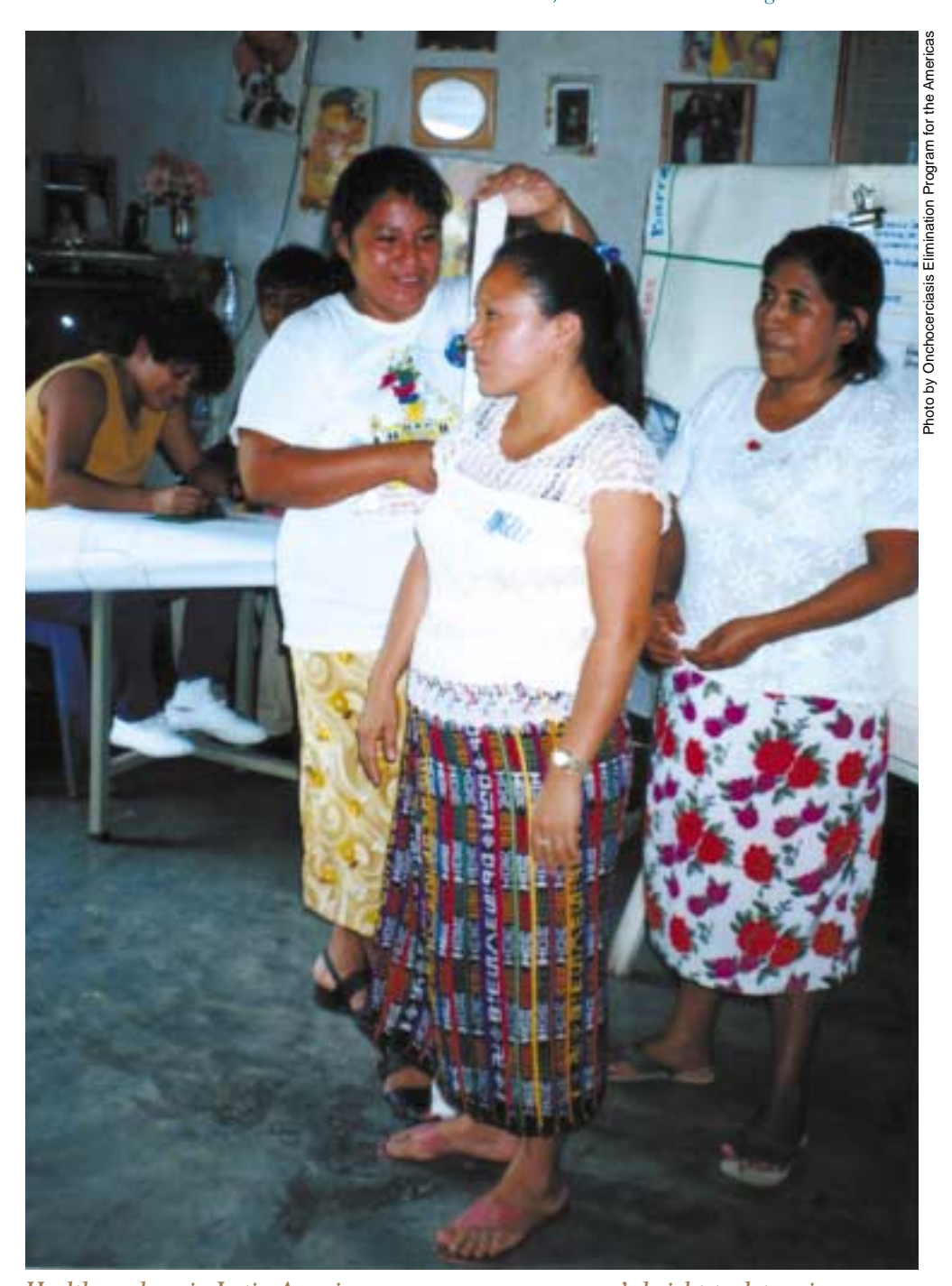
Health workers in Latin America measure a young woman's height to determine her correct dosage of Mectizan, the medication administered twice a year to treat river blindness.

We have been the lead agency among the endemic countries in this hemisphere, and there are several other organizations that share this responsibility with us in Africa, where we are treating about 6.5