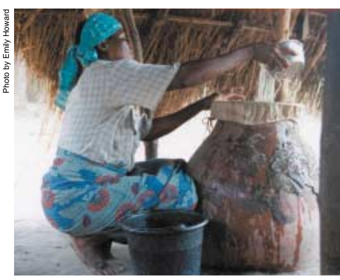
Filtering all drinking water is a key element in eradicating Guinea worm disease.

VOA has agreed to air as many public service announcements as necessary for as long as necessary in a collaborative