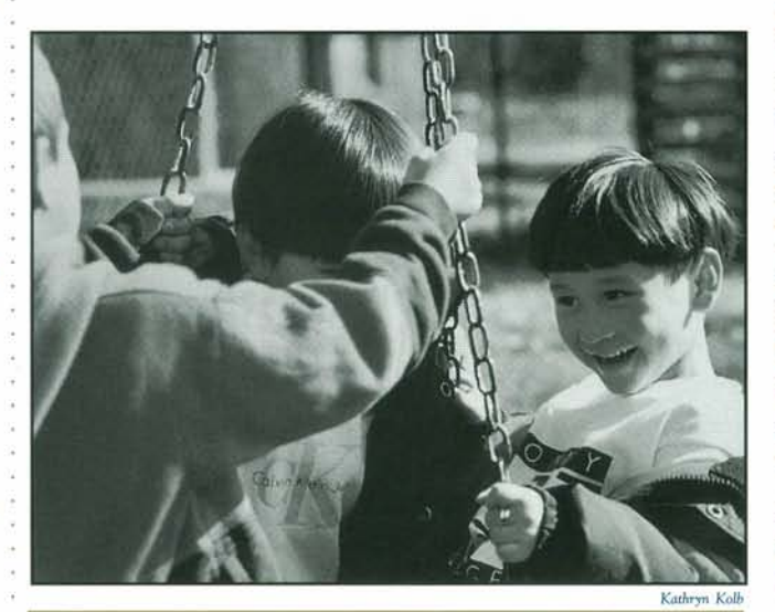
The mental health symposium focused on ways to promote healthy and positive behaviors in children.

the National Resilience Resource Center,