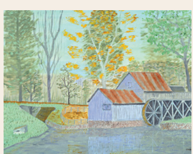
"Old Grist Mill" painting by President Carter

• Two photos of five U.S. presidents signed by each: one for $110,000 and the other for $120,000