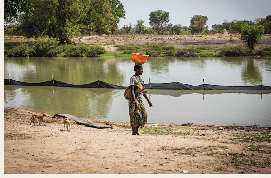
A woman carries a basin of pond water in Tarakoh village, Chad, to her home. A new challenge grant will raise funds to support the eradication of Guinea worm disease in Chad and the handful of other endemic countries.

The Center is already seeing the positive impact of machine learning. For example, some of the oldest data used for mapping the