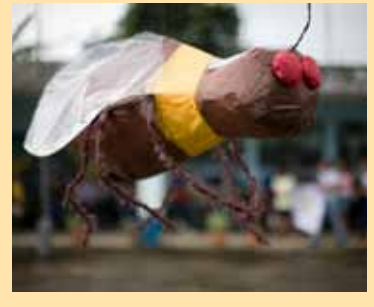
A piñata in El Xab, Guatemala, reminds schoolchildren that tiny black flies transmit river blindness.

This year, Colombia achieved a global health milestone when it was recognized as the first nation in the Americas to halt this devastating disease through health education and use of Mectizan. It also was the first to apply for and be granted verification of elimination of river blindness earlier this year by the World Health Organization.