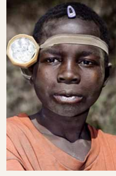
This Congolese child works in a copper mine in the Katanga province of the Democratic Republic of the Congo. An ongoing Carter Center project aims to expose inequities in the country's lucrative mining sector.

That support provides training to a network of over 250 Congolese nongovernmental organizations. The U.S. State Department provided $1.25 million to launch an alert