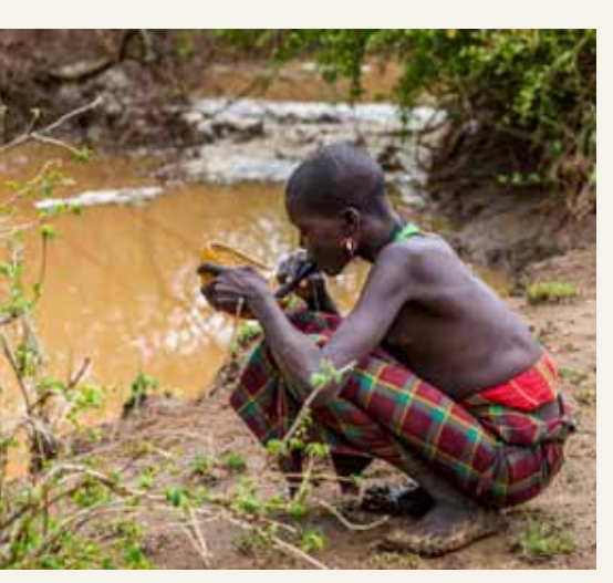
Pipe filters donated by Vestergaard protect against Guinea worm disease.

The 56-year-old company has donated pipe and cloth water filters that protect individuals from ingesting the parasite that causes Guinea worm disease. People in endemic communities pour their household water through the cloth filter or drink from stagnant