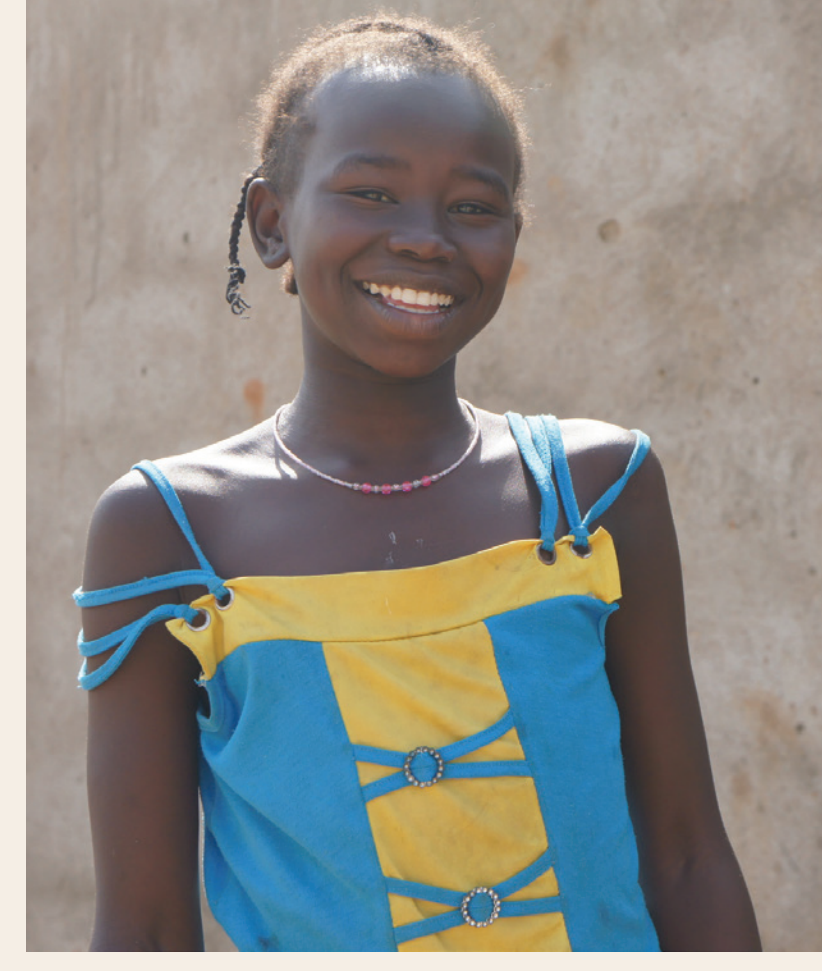
The Sudan Public Health Training Initiative builds the capacity of health workers to serve mothers and children in rural areas.