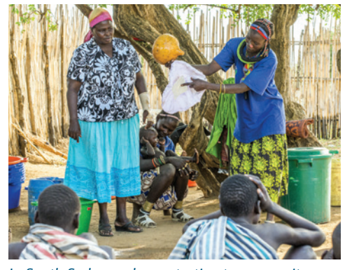
In South Sudan, a demonstration to community members on how and why to use a water filter helps prevent Guinea worm disease.

We take a prevention approach with other neglected tropical diseases as well. River blindness and lymphatic filariasis are spread by insects that bite infected people and then inject the infection into healthy