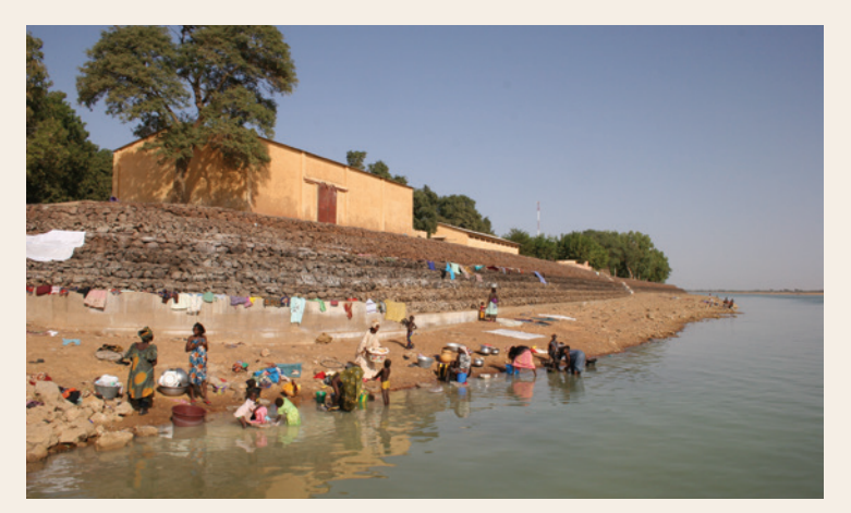
Malian women wash clothes in a river. The Carter Center is overseeing the implementation of a peace agreement in the large country.

The grant is part of the United Nations' Multidimensional Integrated Stabilization Mission in Mali, known as MINUSMA, supporting stabilization efforts in the West African nation, following a rebellion in 2011 and a coup d'état in 2012. A peace agreement between the government and two coalitions of armed groups was signed in 2015. See the News Brief on page 3 to learn more about the project.