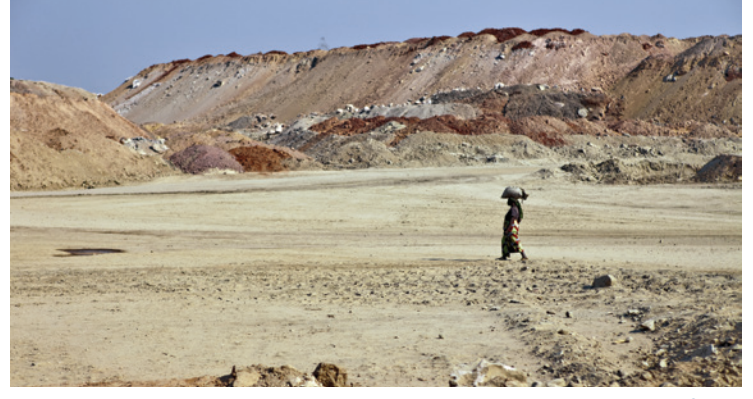
A woman crosses a mining area in Katanga province, Democratic Republic of the Congo. The Carter Center released a report last fall critical of the state-owned mining company's finances.

For example, Nigeria is beset with a full menu of neglected tropical diseases, but we have managed to help eliminate or stop transmission of trachoma, river blindness, and lymphatic filariasis in two states. Corruption is rife in the Democratic Republic of