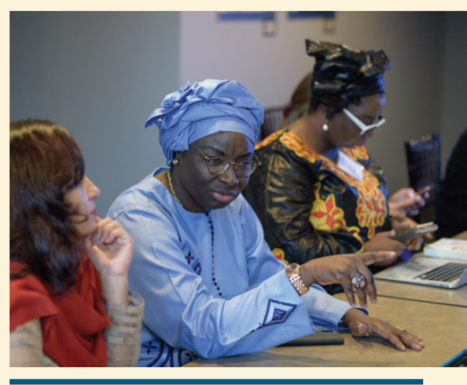
Aminata Touré, former prime minister of Senegal, leads a discussion during the two-day International Conference on Women and Access to Information in February at The Carter Center. Some 100 experts on gender or information participated.

In Bangladesh, women who attended courtyard meetings conducted by local partners later exercised their right to information to find out how to enroll in vocational training programs.