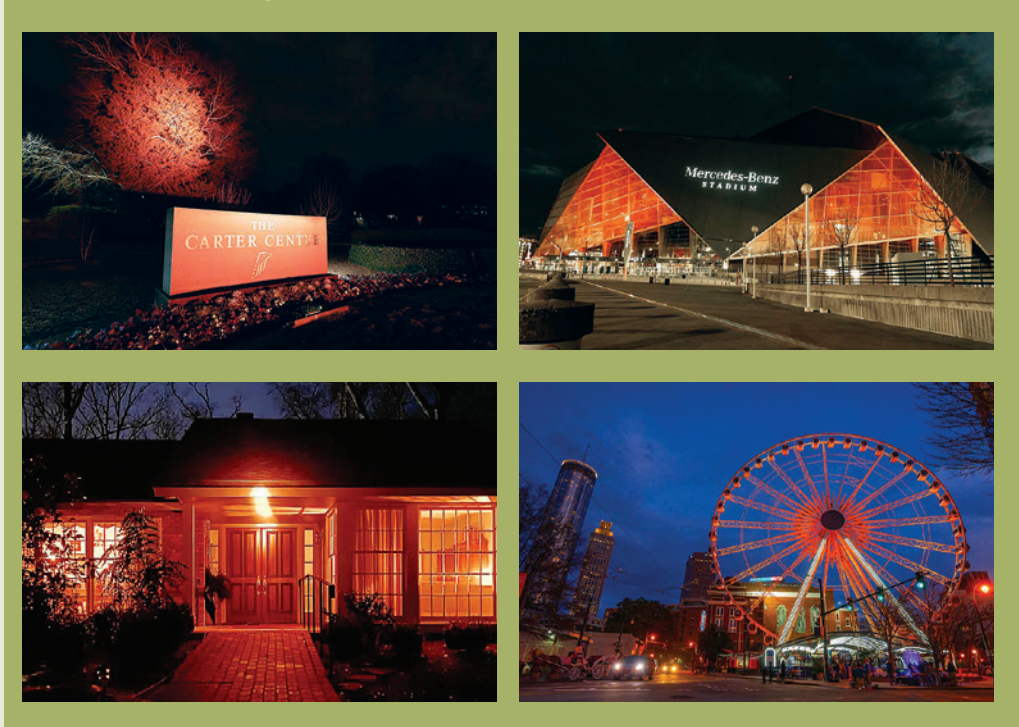
On World NTD Day on Jan. 30, more than 50 landmarks across 25 nations were lit up primarily in orange to celebrate progress in beating neglected tropical diseases (NTDs) and to bring attention to the continued fight against these diseases, which affect the world's most vulnerable populations. Pictured are a few of the sites in Georgia (clockwise from top left): The Carter Center, Mercedes-Benz Stadium, SkyView Ferris Wheel, and the home of former U.S. President Jimmy Carter and former First Lady Rosalynn Carter.

Landmarks Lit for Neglected Tropical Diseases