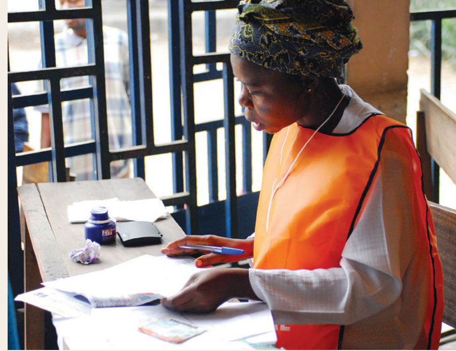
A woman works at a polling site in a past election in the Democratic Republic of the Congo. The Carter Center is working on election reform in the country, including increasing the number of women who run for political office.

Noor Dubai's newest four-year commitment will contribute to the implementation of annual mass drug administration in Amhara. Over the next four years, the Noor Dubai-Carter Center collaboration will contribute to the delivery of 43 million doses of the antibiotic Zithromax<sup>®</sup> (donated by Pfizer Inc), projected to impact approximately 14.3 million people. Additionally, the partnership will support training sessions for more than 74,000 local health workers by 2025 and disease prevalence surveys over the next four years to assess impact.