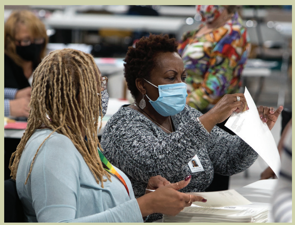
In Gwinnett County, Georgia, two workers count ballots by hand in an audit of the presidential election. The Carter Center sent observers to 24 counties in the state, representing 60% of the votes cast.

The process, according to the Carter Center's final report, should serve as the basis for increased confidence in Georgia's electoral system.