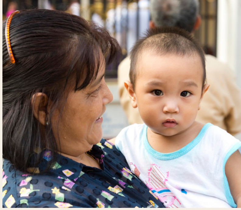
Some Carter Center human rights initiatives focus on women and girls.