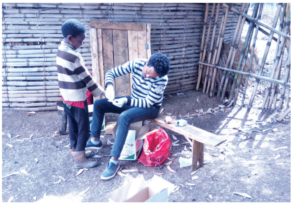
A health worker pricks a child's finger to draw blood for a survey to map and evaluate river blindness in Ethiopia. The country is now in its third year of twice-per-year treatments.

Ethiopia is now in its third year of conducting primarily twice-peryear treatments for river blindness to aggressively pursue its policy of onchocerciasis elimination by 2020. In 2017, Ethiopia delivered a total of 17,864,308 Mectizan treatments, compared to 14,467,640 in 2016. A total of