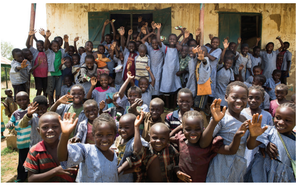
Children from Plateau state—and their neighbors in Nasarawa—will grow up without fear of river blindness.

responsibility in 1996. Along the way, Nasarawa and Plateau also eliminated lymphatic filariasis (LF) and trachoma as public health problems. LF in particular represents a shared win with river blindness because it is also prevented with ivermectin (in combination with albendazole, donated by GSK), demonstrating the power