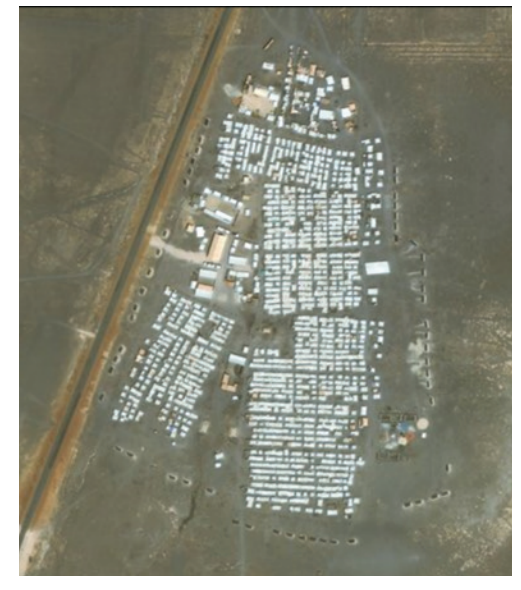
This is an aerial view of Sudan's El Alaga'ia camp, where South Sudanese refugees were provided trachoma and other health services after a baseline survey was completed with assistance from The Carter Center.

The Carter Center plans to continue assisting the Federal Ministry of Health with activities in 2018, including mass drug administration and promotion of the health education components of the SAFE strategy. The national program has shown its commitment to eliminating trachoma as a public health problem not just for its own citizens, but for all those in need.