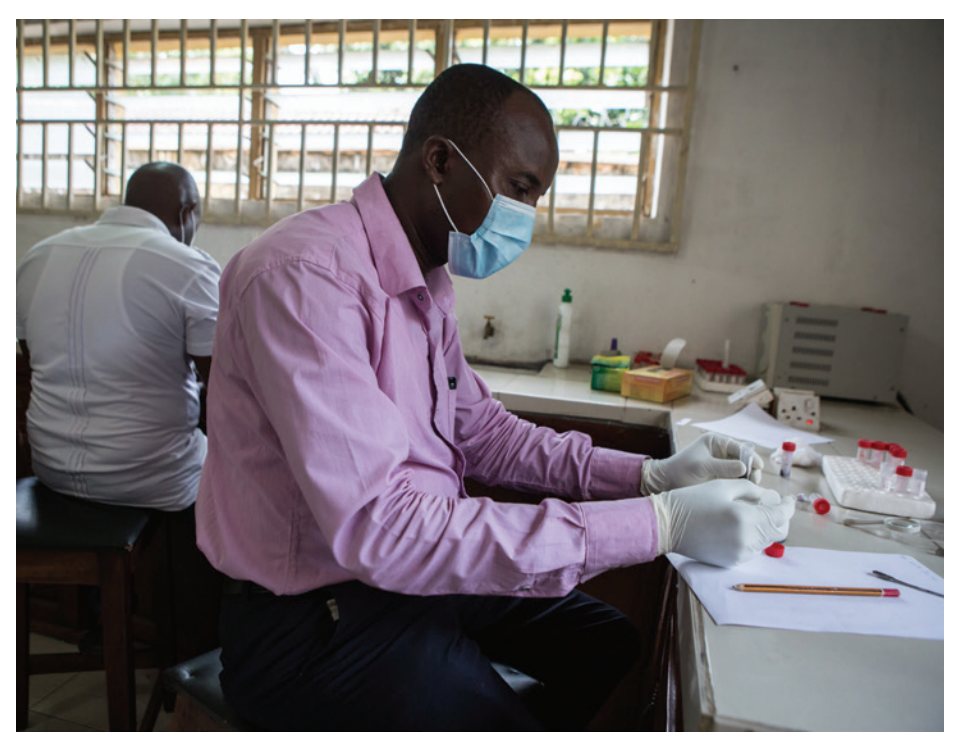
Lab workers test black flies at The Carter Center in Owerri, Nigeria.

The Uganda program continued to make excellent progress with approximately 1.9 million ivermectin treatments halted in the country since it declared in 2007 a goal of river blindness elimination from all 17 transmission zones (foci). At the 2017 Uganda Onchocerciasis Elimination Expert Advisory Committee meeting, two more foci (Kashoya-Kitomi and Wambabya-Rwamarongo) successfully completed post-treatment surveillance and were reclassified as having achieved transmission elimination, based on the WHO elimination guidelines. Two additional foci (Wadelai and West Nile) were reclassified as having interrupted transmission. Three foci (Budongo, Bwindi, and Nyagak-Bondo) are suspected to have interrupted transmission, while the remaining two foci (Lhubiriha and