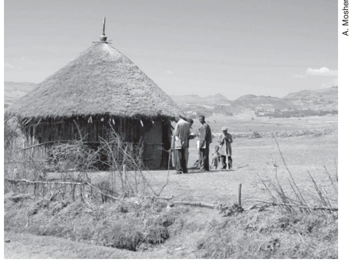
Household surveys were conducted in malarious areas in three regions in Ethiopia.

region, followed by Amhara at 4.6 percent, with lowest prevalence of 0.9 percent in Oromia. By species, 57 percent of infections were due to the most dangerous form of malaria, P. falciparum . There was little difference in malaria prevalence by age group, confirming that in Ethiopia, all ages are susceptible to infection and disease. Although malaria positivity dropped