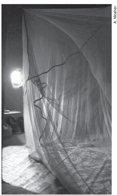
A new insecticide-treated net, properly hung in a household in the zone of Jimma, Oromia region, Ethiopia.

These messages will be incorporated into training efforts of health extension workers in the Trachoma Program and community drug distributors in the River Blindness Program to take advantage of their existing access to communities, helping to ensure that malaria control messages reach households at the same time they receive other program-specific messages. Workers' movement through communities also will be utilized to give feedback to the program on the success—net usage, proper hanging of nets—of this initiative.