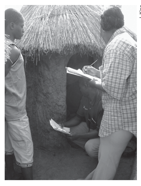
Ghana National Service volunteers inspect a latrine.

This evaluation found that in Carter Center-assisted communities in the Northern region of Ghana, household latrine coverage has increased from 0 percent to 88 percent of households having a usable latrine over a two-year period. In addition, feces were found in 71 percent of the latrines, showing that a majority of households in the communities have adapted their behavior. There is a need for heightened health education and behavior change activities that the program will continue to address. The latrine promotion program increased latrine access and use in all selected communities and should be encouraged as a model for other latrine programs in northern Ghana.