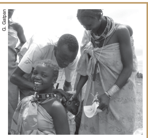
A village volunteer distributes Guinea worm filters and administers tetracycline eye ointment to a Southern Sudanese family — integration in action.

In 2006 and 2007, The Carter Center in Southern Sudan has focused on expanding infrastructure to help better deliver program interventions. With this platform, the two health programs are better placed to respond to the needs of the Ministry of Health for the government of Southern Sudan, in addition to enhancing collaboration with other partners. The Guinea Worm Program staff have extensive local cultural knowledge, enabling them to deliver both programs at the same time.