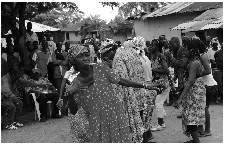
Opposite: A village elder learns about her new rights from members of the Carter Center-sponsored Modia Drama Club. Above: A woman from the village of Galai, Liberia, celebrates following a dramatic presentation on the country's new laws.

The ravages of war and Liberia's history of "internal colonialism" have undermined public confidence in the political and justice systems at every level. The former US slaves who settled Liberia created Africa's first independent republic in 1847 and subsequently controlled the state with the help of indigenous leaders, extracting resources and labor from rural areas while returning only a fraction of the benefits. Control of the state by Monrovia-based settler elites and their indigenous supporters led to the systemic