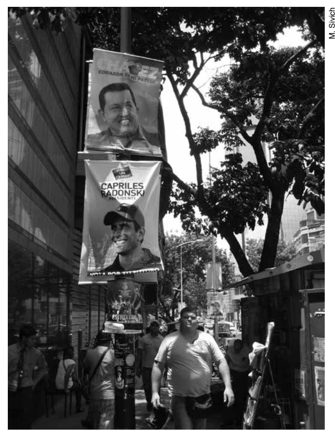
Campaign propaganda in the streets of Caracas supported Capriles.

leadership, and "Guidelines for a Governing Program of National Unity," agreed to in December by five of the six opposition presidential candidates.<sup>13</sup>