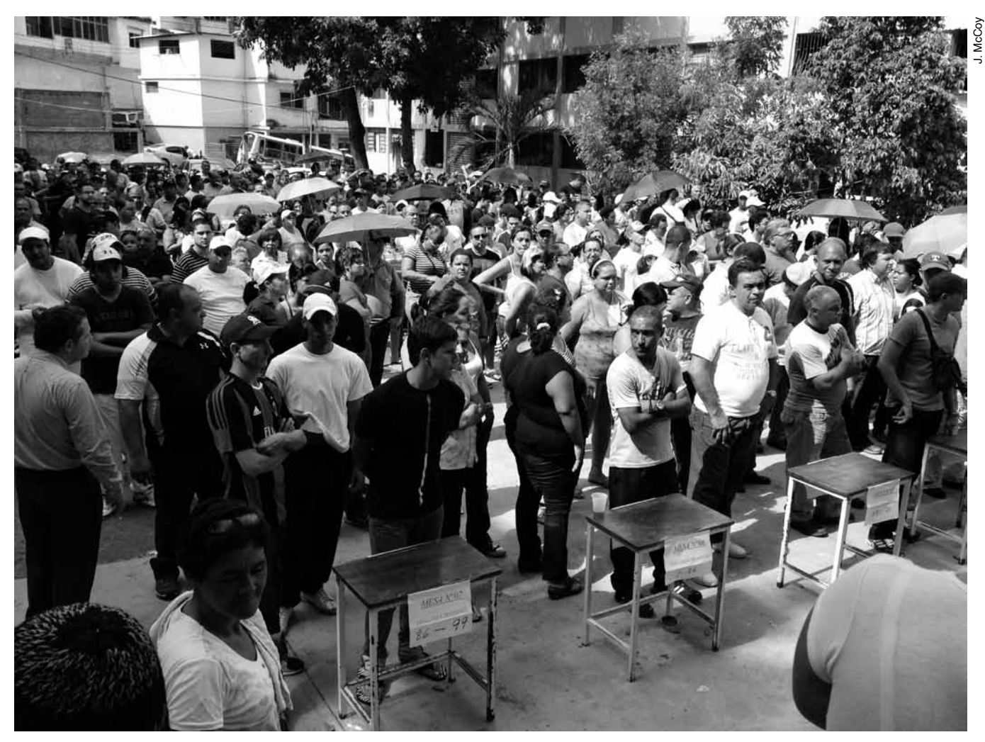
Voters in Vargas state line up to approach the SIE laptops.

precinct-by-precinct turnout information to political parties so as to aid their get-out-the-vote efforts during the day. Given that the opposition had no testigos inside the CNE office receiving this information, and with the perception of the CNE as partisanbiased, some in the opposition feared that this system helped the PSUV mobilize its voters to the disadvantage of the MUD.