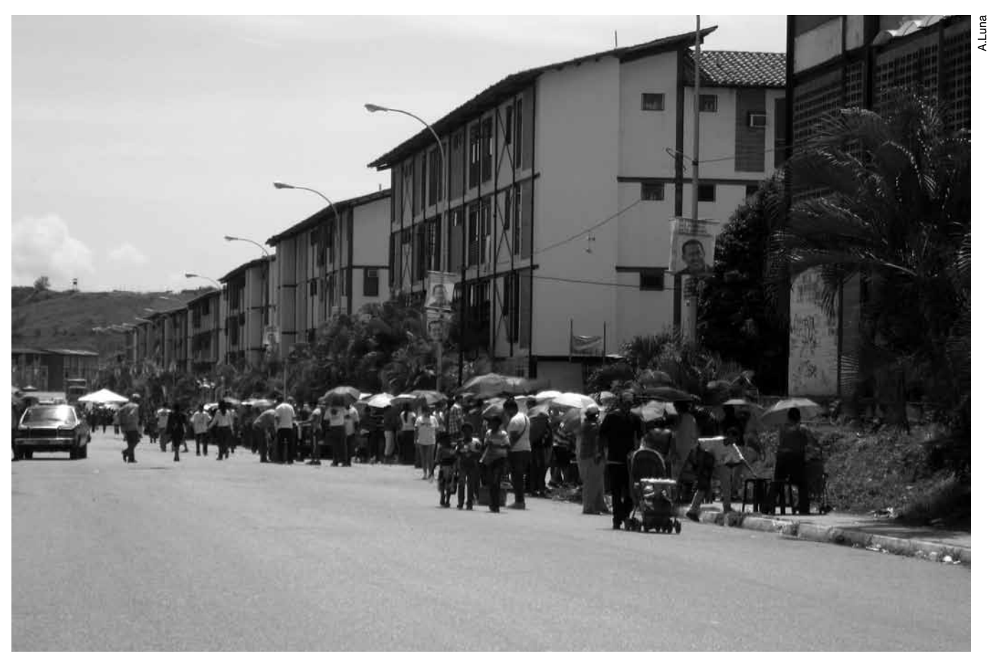
Long lines formed in Valles del Tuy on voting day.