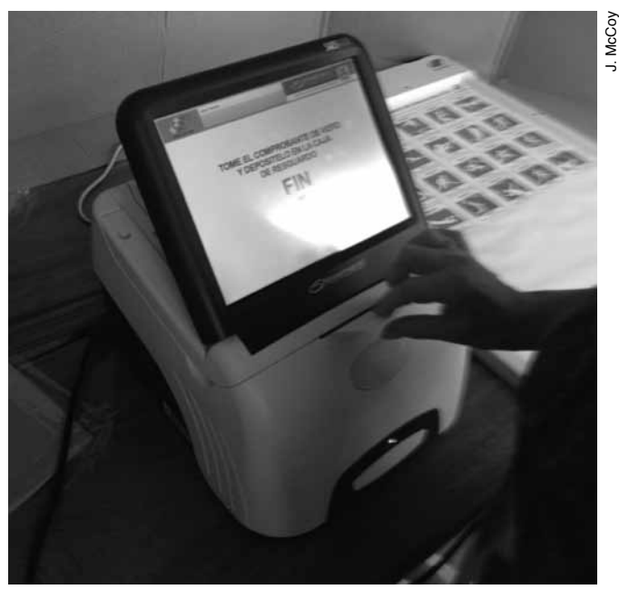
A voter removes the paper receipt after voting during an Aug. 5 election simulation in Venezuela.

If the fingerprint does not match (or voters without fingers or both hands in casts appeared), the president of the table can initiate the voting machine with a code up to seven (or five for voters without fingers) times in a row. If a table president exceeds this limit, the machine gets blocked, and the president of the mesa needs to call CNS (Centro Nacional de Soporte) to get a new code and unblock the voting machine.