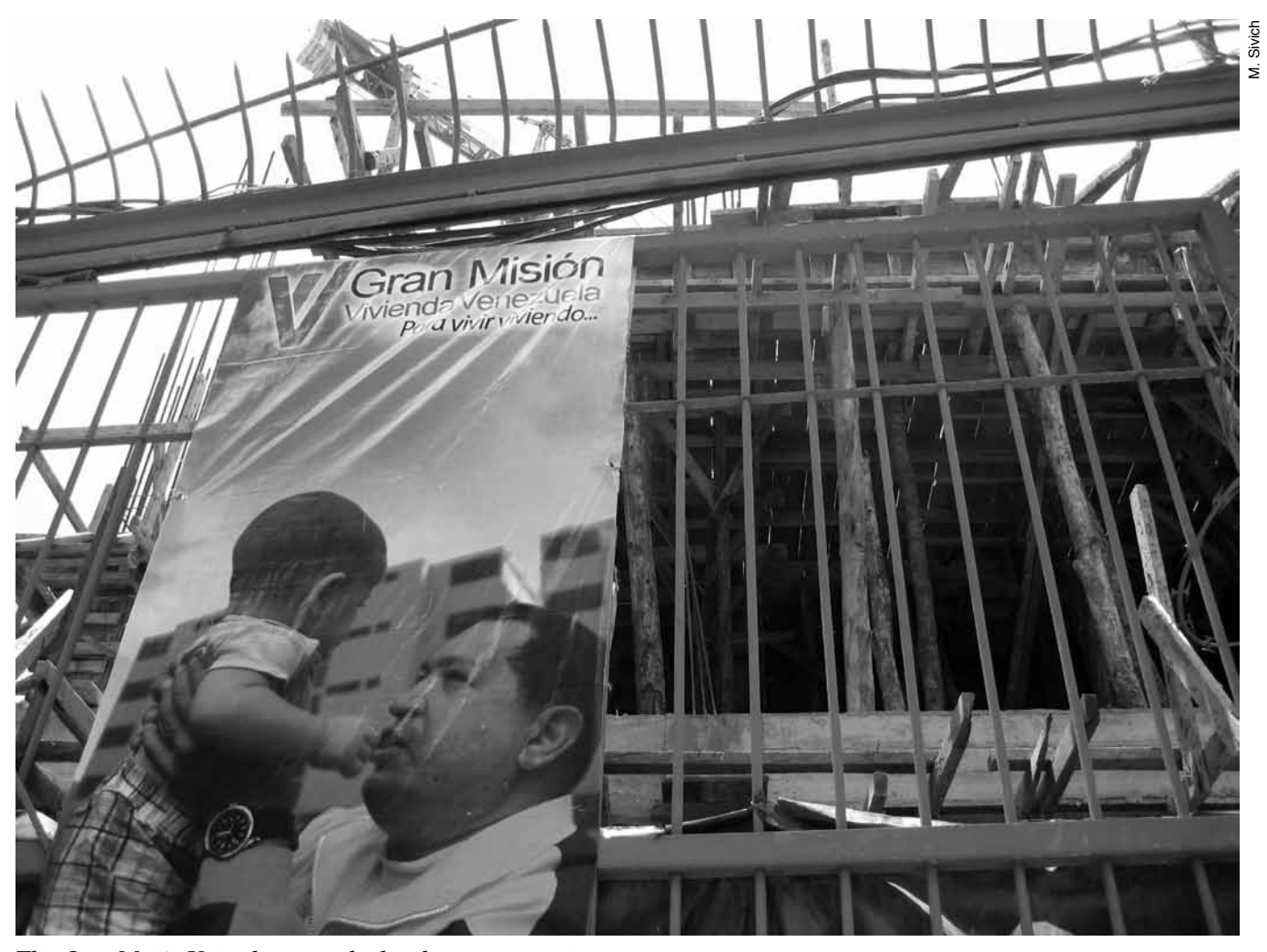
This Gran Misión Vivienda poster, displayed on a construction site, advertises a home ownership program.

Government spending on social programs and services is legal and a common advantage of an