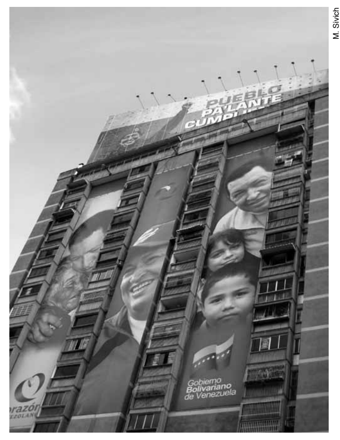
Chávez propaganda was displayed on a housing complex in Caracas.

interprets the content of the cadenas as falling into a gray area regarding what exactly constitutes electoral propaganda.<sup>40</sup>