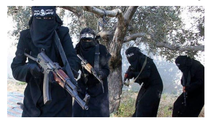
(Members of Al-Khanssaa Brigade.)

Participants in Violence: As Daesh has been losing fighters and territory on a large scale recently