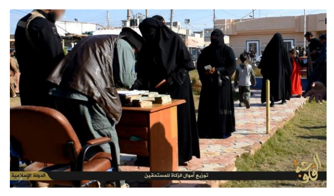
(The Circulation of Zakat in Fallujah province.)

This tragic story provides insight into how Daesh's multilayered recruitment propaganda harms the everyday lives of communities.