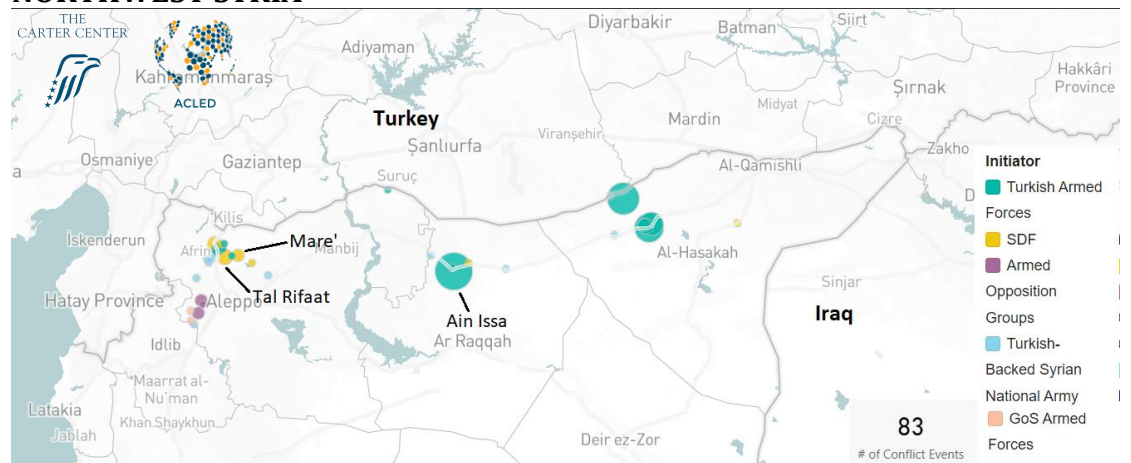
Figure 2: Conflict involving Turkish armed forces and their allies on the one side and the SDF and GoS armed forces on the other side between 1-31 October 2021. Largest bubble represents 13 conflict events. Data from The Carter Center and ACLED.