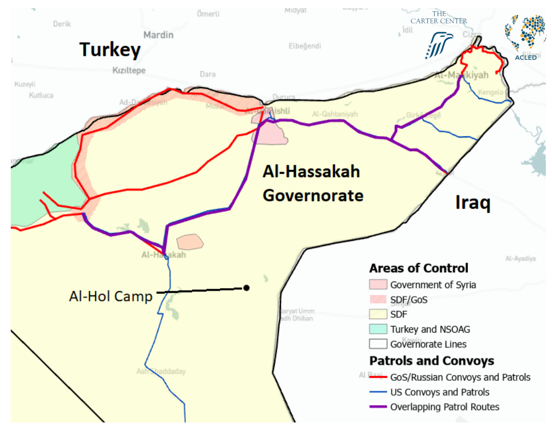
Figure 4: Al-Hol camp in Al-Hassakah Governorate, northeast Syria. Data from The Carter Center and ACLED.