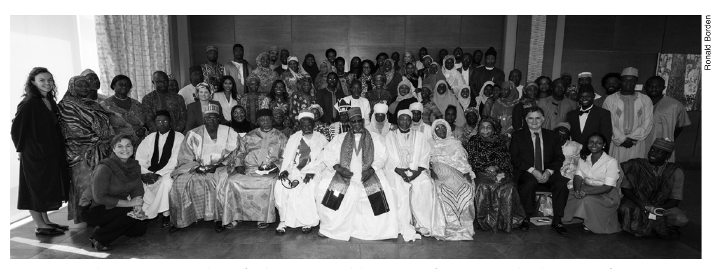
Participants in the 2015 Human Rights Defenders Forum: Mobilizing Action for Women and Girls in West Africa

Of significance to participants from Nigeria, Liberia, Sierra Leone, Niger, Senegal, and Ghana was the role religious and traditional values can and should play in advancing peace and respect for every human being. Given the high levels of religiosity in the region—and religious and traditional leaders' prominence at all levels of life—many participants were distressed that this influence and reach have not been better employed by those seeking to improve respect for human rights. They expressed understanding that although religion has been traditionally viewed as a driver of conflict, religious leaders have been involved in peace and human rights work for years. They were eager to hear the testimonies of religious and traditional authorities on